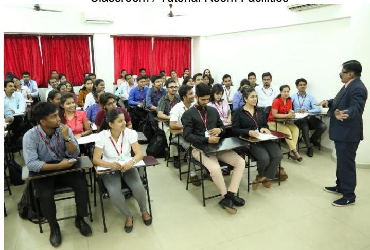
Classroom / Tutorial Room Facilities